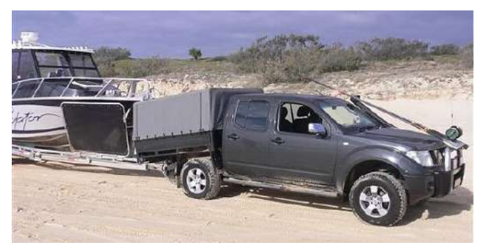
An extension hitch to a tow bar requires careful consideration to prevent this from happening.