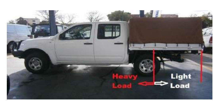
Incorrect length tray for the wheel base and load carrying capacity.

It's not just the "Towed Mass" that must be known but the weight placed onto the tow ball, "C".