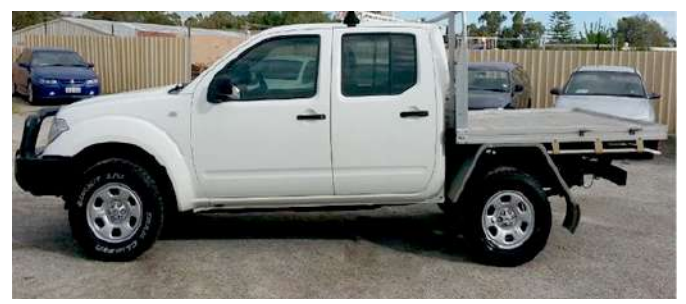
Correct length tray for the wheel base and load carrying capacity.